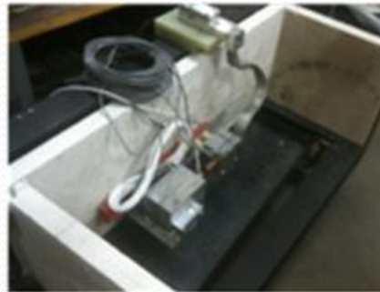
copper contacts / simulated fault